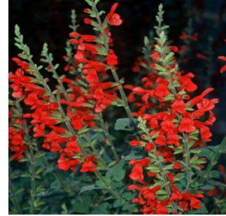
Salvia 'Vermilion Bluffs'