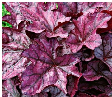
Heuchera 'Plum Royale'