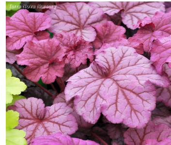
Heuchera 'Berry Smoothie'