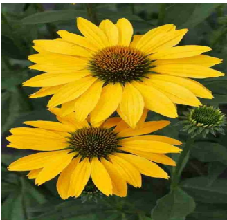
Echinacea 'Now Cheesier'