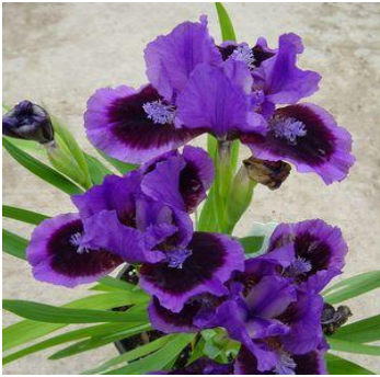
Iris pumila 'Smart'