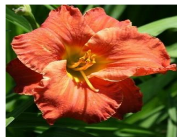
Hemerocallis 'Caribbean Coral'