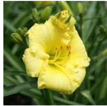
Hem. 'Montego Melon'