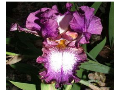
Iris g. 'Tennison Ridge'