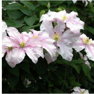
Clematis 'Morning Mist'