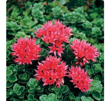
Sedum 'Summer Glory'