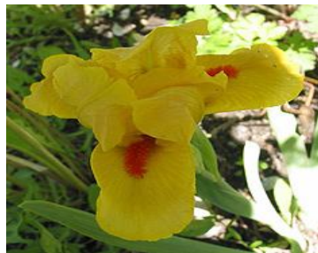
Iris g. 'Circus Dragon'