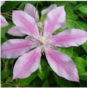
Clematis 'Sugar Candy'