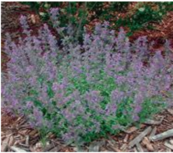
Nepeta 'Psfike' Little Trudy