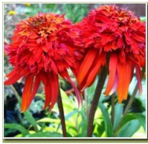
Echinacea 'Hot Papaya'