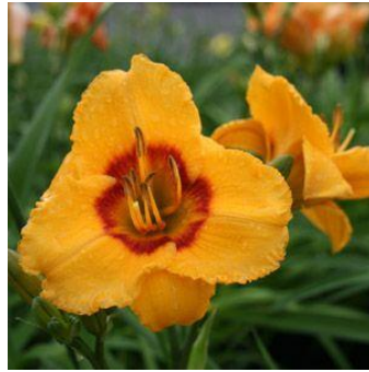
Hem. 'Kokomo Sunset'