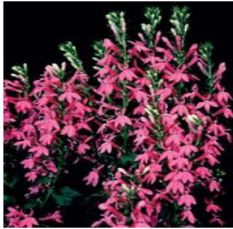
Lobelia 'Monet Moment'