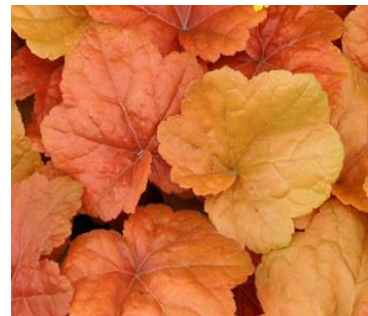
Heuchera 'Southern Comfort'