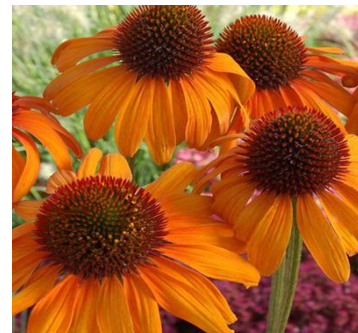
Echinacea 'Tiki Torch'