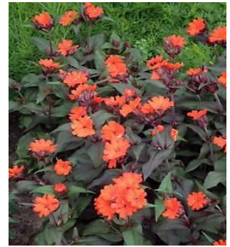
Lychnis 'Orange Gnome'