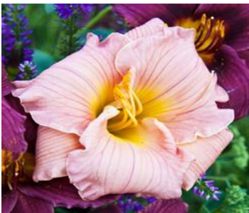
Hem. 'Pink Abundance'