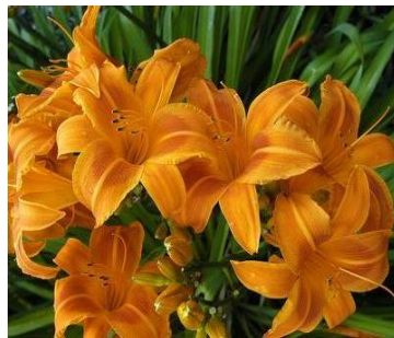
Hem. 'Rocket City'