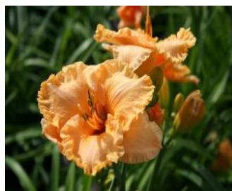
Hemerocallis 'Bermuda Peach'