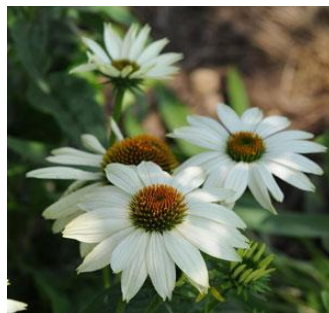
Echinacea 'PowWow White'