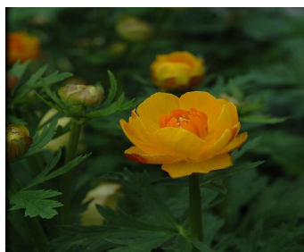
Trollius 'Orange Crest'