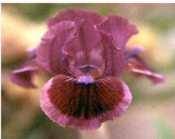
Iris g. 'Cat's Eye'