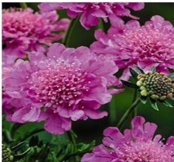
Scabiosa 'Pink Diamonds'