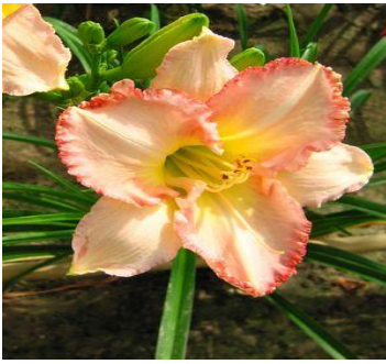
Hem. 'Jamaica Sunrise'