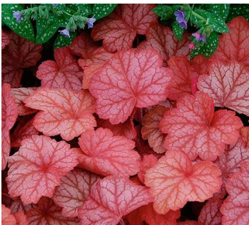
Heuchera 'Georgia Peach'