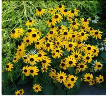
Rud. 'Early Bird Gold'